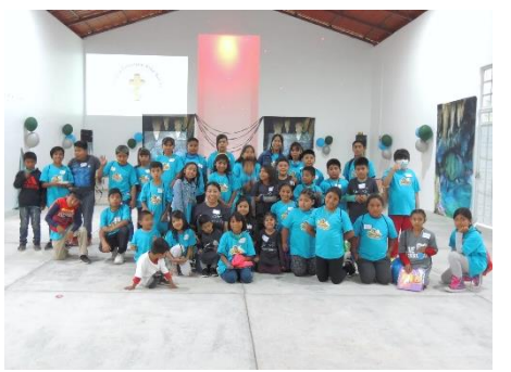
Children's ministry in Santiago Naranjas