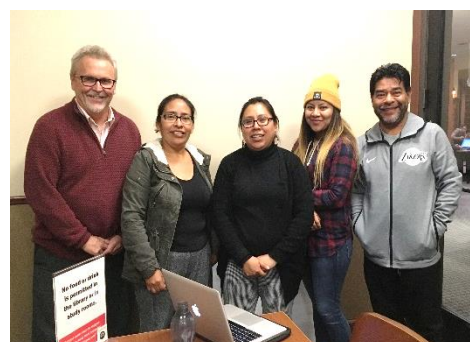
Tu'un Savi (Mixtec) Language Team (CSUCI)