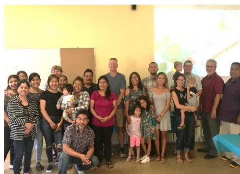
Mission Vida Nueva Launch Team