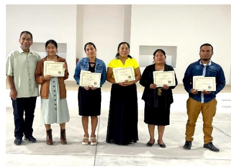
Graduates of Book 1 of SEAN Lay Training