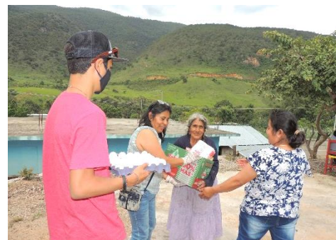
Food for the hungry of Santiago Naranjas