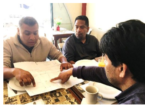
Meeting in Ensenada to plan mission plant